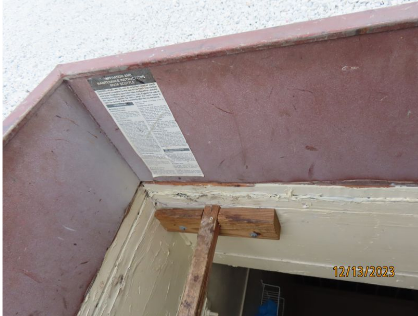
Structural: Reinforced Concrete